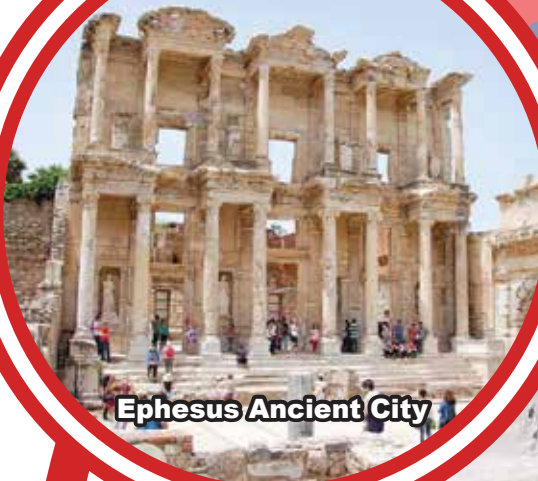
Ephesus Ancient City

INCLUDED 02 NIGHTS MODERN CAVE DESIGN HOTEL / STONE CAVE DESIGN HOTEL Visit Mevlana Museum FREE Turkish Ice Cream Bosphorus Cruise Tour Enjoy Belly Dance Show at Cappadocia Cave