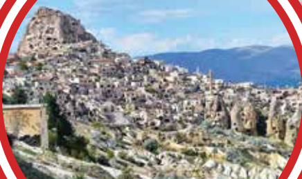
Uchisar 'Castle' Village